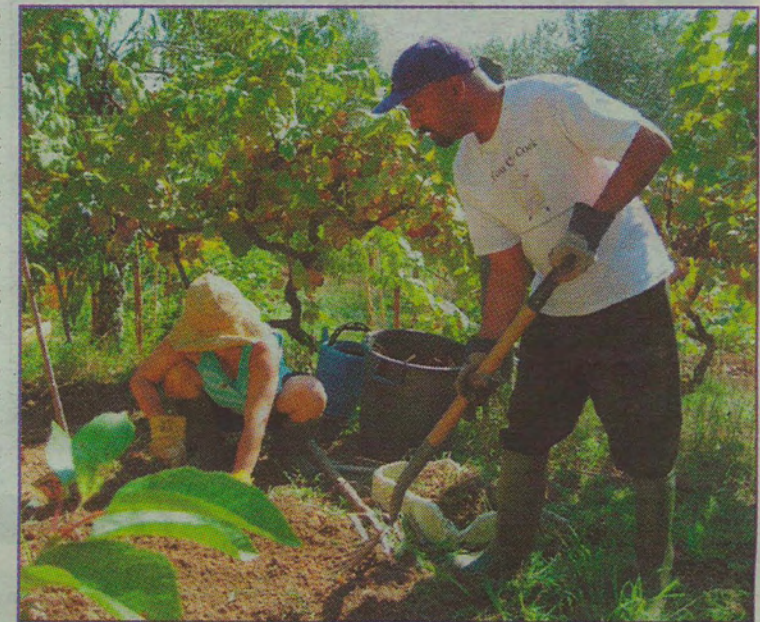
Bosco tackles the weeds during his lessons on self-sufficiency